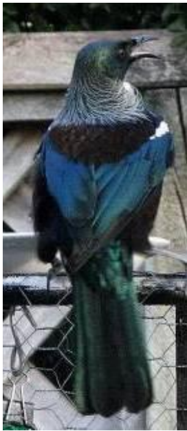
Note point of rear claw

Looking out of my lounge window I spotted my dog Meg with a bird in her mouth. It was a tui and it must have hit a window and fallen to the ground to be pounced upon. It's a natural thing for a spaniel to do, being a gun dog also meant she has a soft mouth. Reluctantly, Meg opened her jaws and allowed me to retrieve the bird, which promptly stuck its claws into my little finger. Have you ever looked at a tui's claws? I certainly hadn't. They have a razor sharp point which hurts like anything when stuck into a finger. I released the bird onto an outside table; however it didn't look too flash. So I put it into a box and delivered it to those helpful people at Nga Manu Nature Reserve. Phoning in a couple of days later, I was told it was doing fine and would be released shortly.