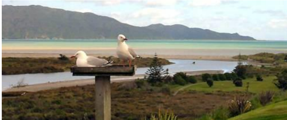
Photograph Eileen Thomas