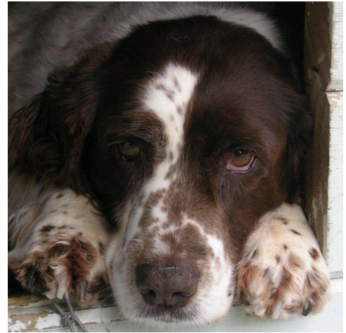
It wasn't me I did nuffing