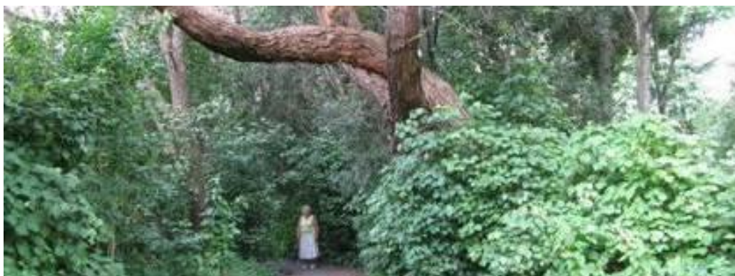
The Waikanae river cycle and walkway