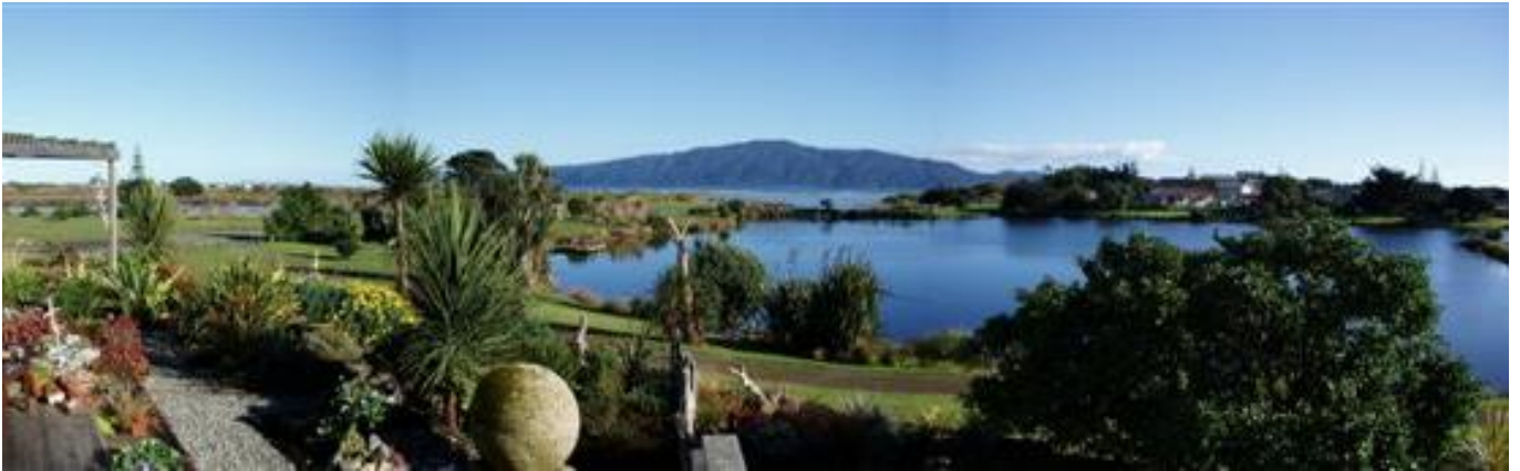
Waimanu lagoon Waikanae beach